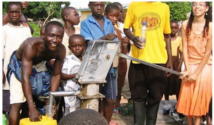
A Well that was built by World Vision in a countryside village not far from Amazing Grace School.

The water that Amazing Grace is currently serving the students is trucked in weekly. If the Amazing Grace School can raise the funds to drill and establish a working well on its property they would save a sig-