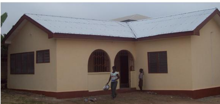
The New Kitchen